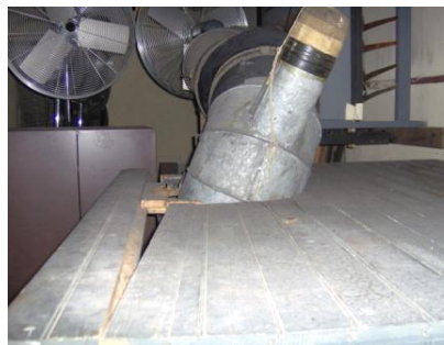
The main air supply was no longer perpendicular to the cabinet which was split.