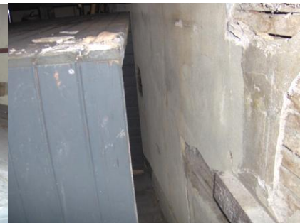
The cabinet had shifted a foot away from the wall on one end.