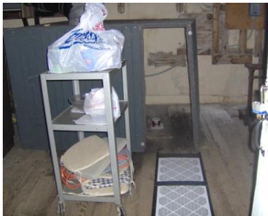
The door with its air filters for the cabinet housing the Spencer Blower was on the floor.

It was two days before Christmas Eve when I turned on the Beman/Carey Organ - St. Mary's Binghamton - at my usual practice time. Halfway through my warm-up piece (the Brahms chorale based on Lo How A Rose is Blooming ), I heard a rumble. I thought it was a passing truck on Church St. , a sound I have often heard. But this sound kept getting louder. I thought I felt the organ bench shake as it has twice recently during documented earthquakes. Instantly, I turned off the organ. The rumble stopped! "Better check on the blower two floors down in the basement." I thought. As I approached the room containing the blower, I could smell a hot odor. Unlocking the door, I saw: