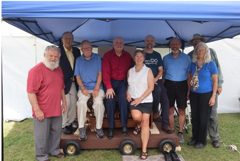
Binghamton Chapter Members