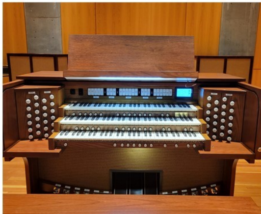
Hamilton College, Clinton, NY – custom 3-manual Allen GENISYS organ with 47 stops

Your trusted partner for digital and pipe organs New and pre-owned instruments, all types of service